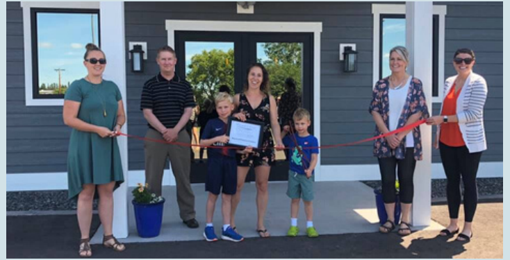
Hayward Fitness Fanatics - June 25

Please click on the photo of the business to find their Facebook page for more info!