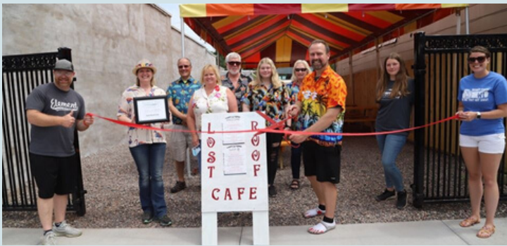
Lost Roof Cafe - June 26

Congratulations to all these businesses on their current endeavors!