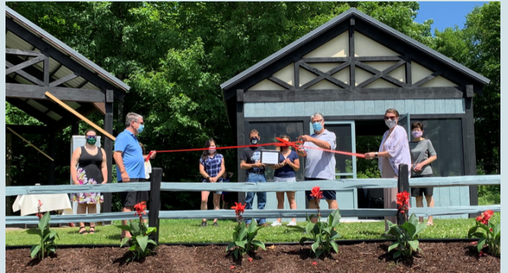
Tally Ho Supper Club - June 30

Congratulations to all these businesses on their current endeavors!