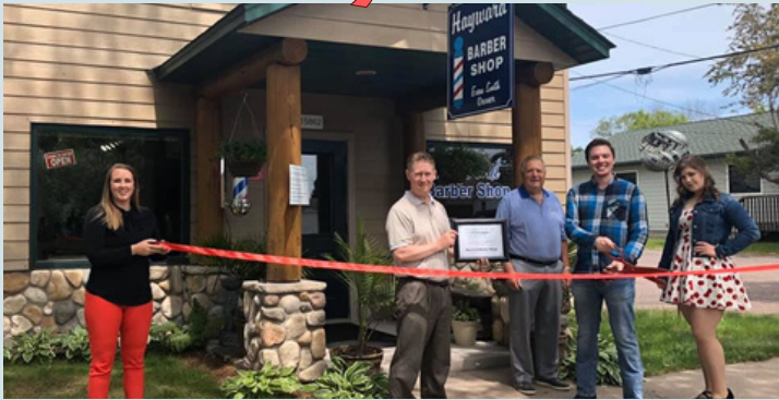
Hayward Barber Shop - June 9

Please click on the photo of the business to find their Facebook page for more info!