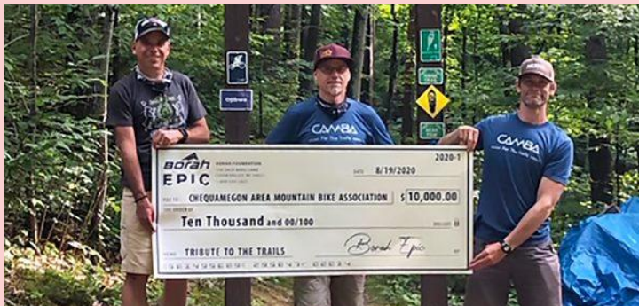
Despite not holding a race this year, the Borah Epic was still able to make an annual contribution of $10,000 to CAMBA

**Pictures and information were provided on business or organization Facebook pages