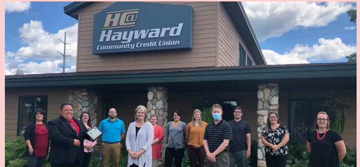
Our Chamber presented the Hayward Community Credit Union with the "Small Town, Big Heart" award on July 28. HACC presented this award to thank HCCU for a $5,000 grant we received in June

**Pictures and information were provided on business or organization Facebook pages