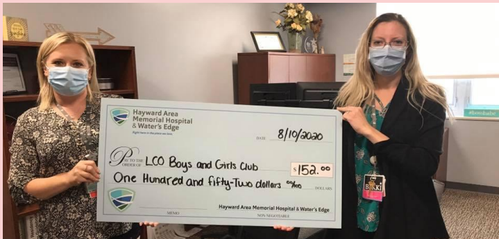
The Hayward Area Memorial Hospital + Water's Edge donated $152 to the LCO Boys & Girls Club