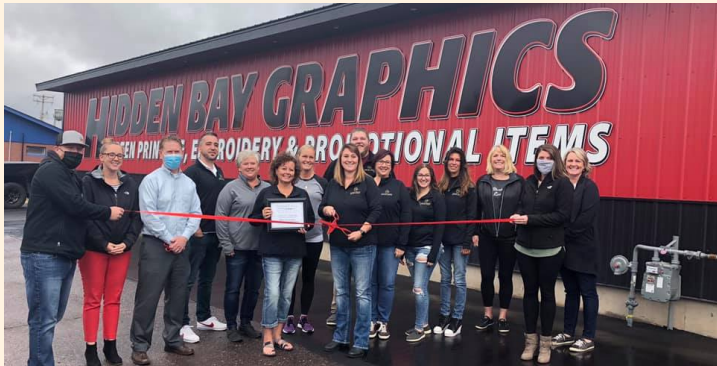
Hidden Bay Graphics - Oct. 1