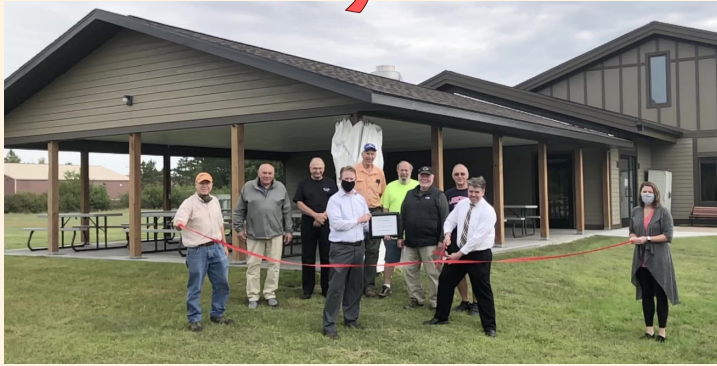
Grace Lutheran Church - Sept. 1

Please click on the business name to visit their website or social media