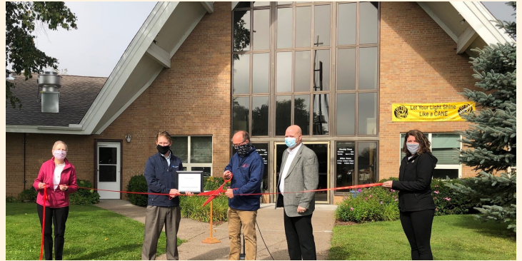
First Lutheran Church - Sept. 10

Please click on the business name to visit their website or social media