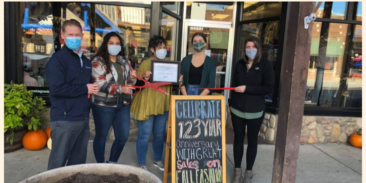
Gliks - Oct. 1