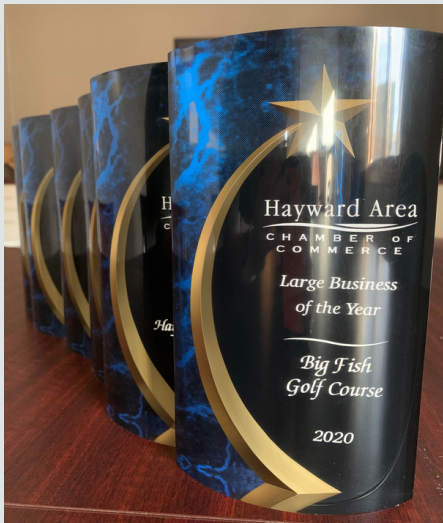
Large Business of the Year: Big Fish Golf Course