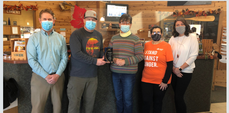
Service Organization of the Year: Hayward Community Food Shelf