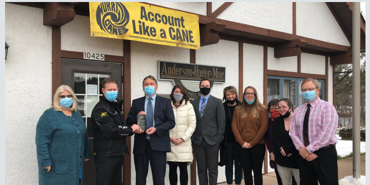
Small Business of the Year: Anderson, Hager & Moe S.C.