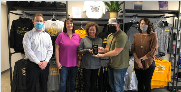
New Business of the Year: Hidden Bay Graphics