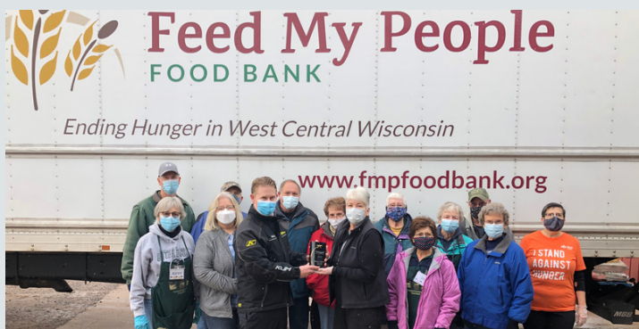
Volunteer of the Year: Hayward Community Food Shelf Volunteers