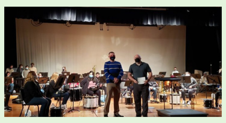
The <u>Hayward Community Credit Union</u> presented the <u>Hayward Music Program</u> with $200 on March 1.

The Hayward Area Memorial Hospital + Water's Edge donated their Casual for a Cause from February and March to Memorial Blood Centers for $431.