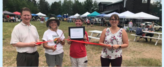
June 7 Ribbon Cutting to celebrate the Hayward Farmers Market