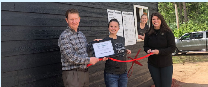
May 26 Ribbon Cutting to celebrate Backroad's Coffee & Tea Drive-Thru