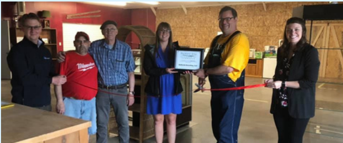
May 20 Ribbon Cutting to celebrate Da North Recycling