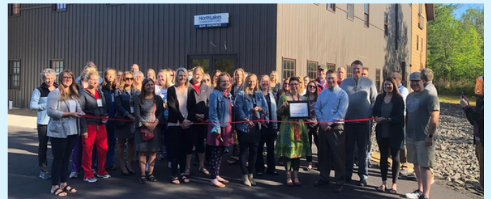
June 22 Ribbon Cutting to celebrate NorthLakes Community Clinic