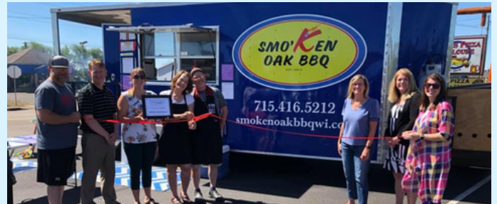
June 18 Ribbon Cutting to celebrate Smo'Ken Oak BBQ