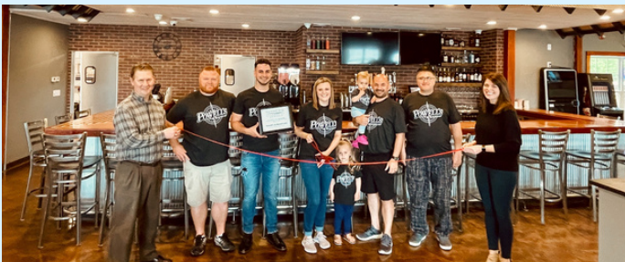
May 26 Ribbon Cutting to celebrate Powell's on Round Lake