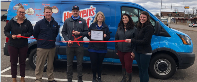
May 4 Ribbon Cutting to celebrate Heaven's Best Carpet Cleaning