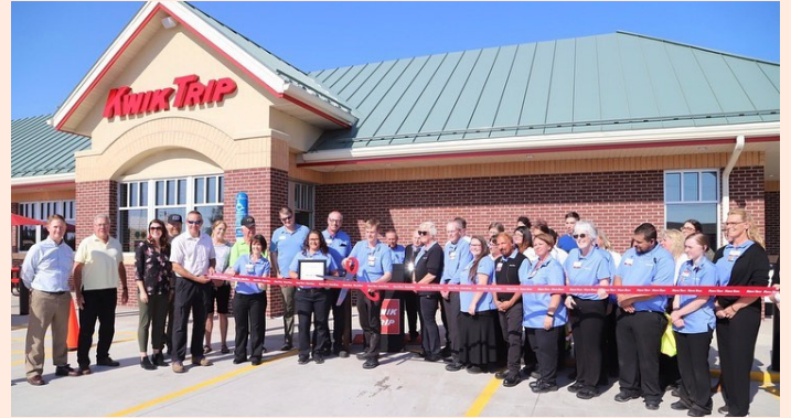
September 30 Ribbon Cutting to celebrate the grand opening of Kwik Trip #1112