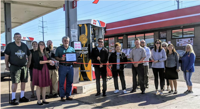
September 29 Ribbon Cutting to celebrate the Northern Lakes Cenex Hurricane Pride Pump