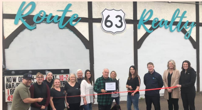
October 28 Ribbon Cutting to celebrate the grand opening of Route 63 Realty