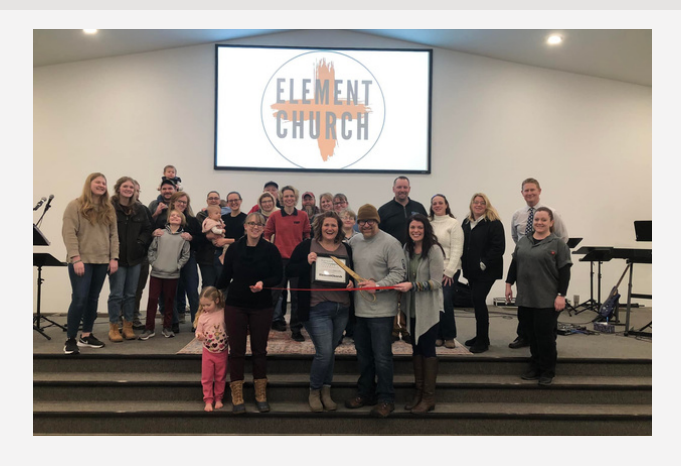
February 3 Ribbon Cutting celebrating <u>ELEMENTChurch</u>'s new building & location