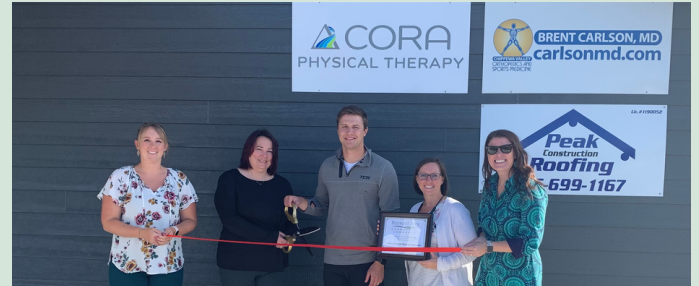
August 11 Ribbon Cutting to celebrate CORA Physical Therapy - Hayward