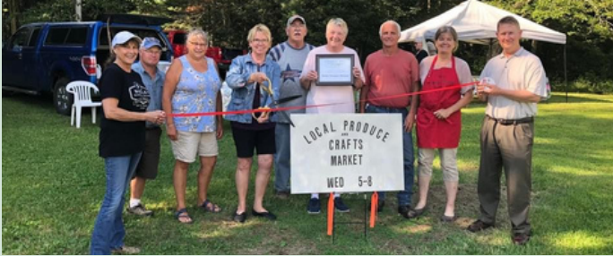
July 27 Ribbon Cutting to celebrate the Seeley Farmer's Market .