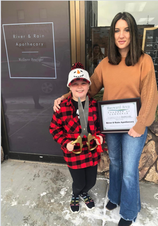
December 1 Ribbon Cutting to celebrate River & Rain Apothecary