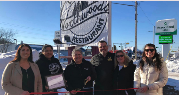
February 8 Ribbon Cutting to celebrate Little Northwoods Restaurant