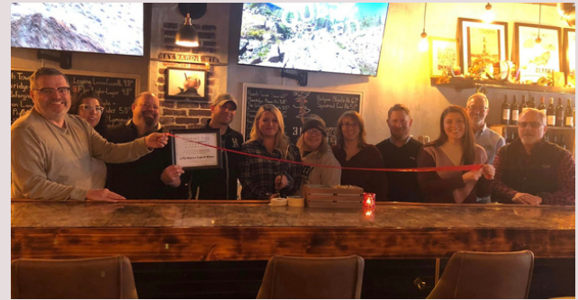
February 20 Ribbon Cutting to celebrate 3 Fly Sisters Taps & Wines