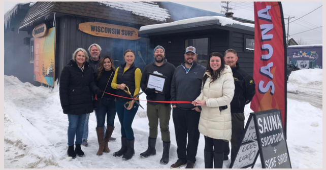
January 13 Ribbon Cutting to celebrate Wisconsin Sauna