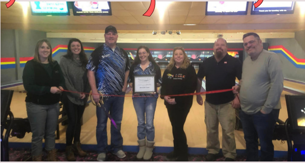
January 5 Ribbon Cutting to celebrate Riverside Lanes Bowling Alley