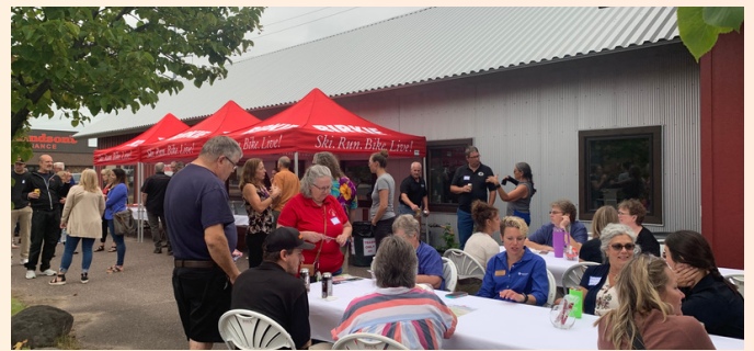
Business After 5 @ The Birkie