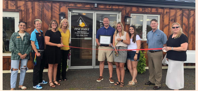
August 3 Ribbon Cutting to celebrate Pine Point Real Estate & Property Management