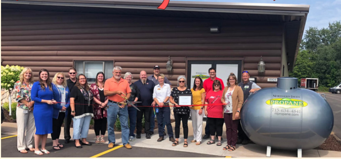
August 1 Ribbon Cutting to celebrate Northern Lakes Cooperative's New Business Office