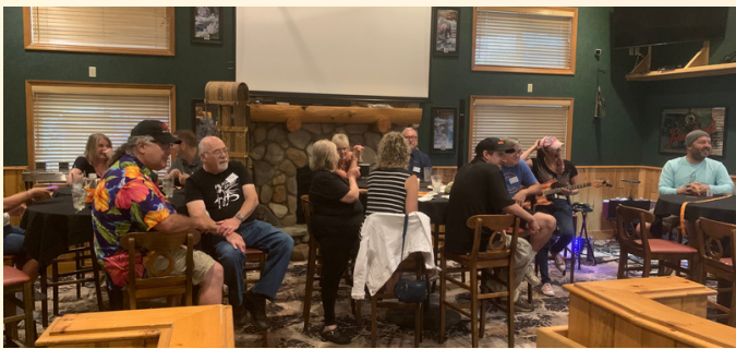
Business After 5 @ Flat Creek

All members are invited to BA5 events & we hope to see you all at the next event!