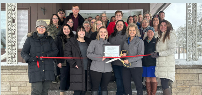
October 31 Ribbon Cutting to celebrate Northwest Connection Family Resources receiving a Family Resource Center of Quality Accreditation (1 of 5 in the state)