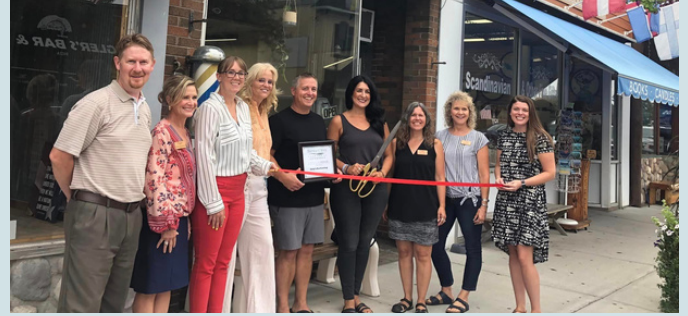
September 5 Ribbon Cutting to celebrate Grey's Barbershop