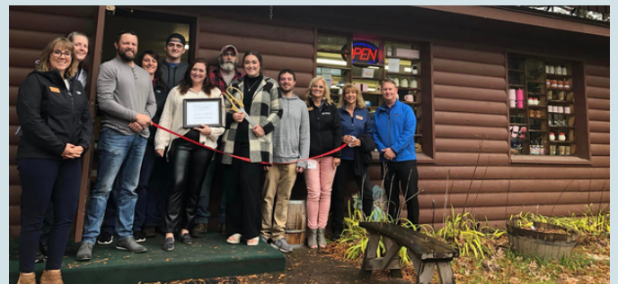
October 13 Ribbon Cutting to celebrate Wilde Gifts & Goods