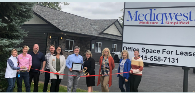
September 13 Ribbon Cutting to celebrate Mediquest Insurance