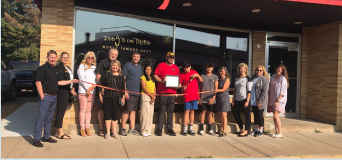
September 1 Ribbon Cutting to celebrate Eddy's on Third