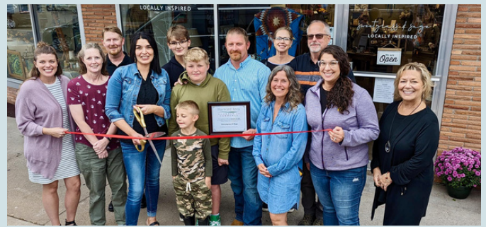
September 22 Ribbon Cutting to celebrate Sweetgrass & Sage