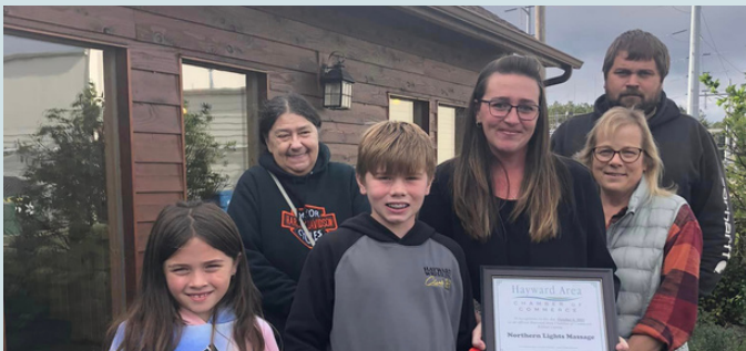
October 6 Ribbon Cutting to celebrate Northern Lights Massage