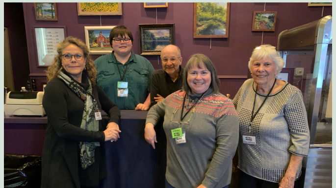
Business After 5 @ The Park Center on December 7