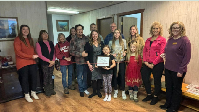
December 18 Ribbon Cutting to celebrate Czarnecki VenRooy Law Office