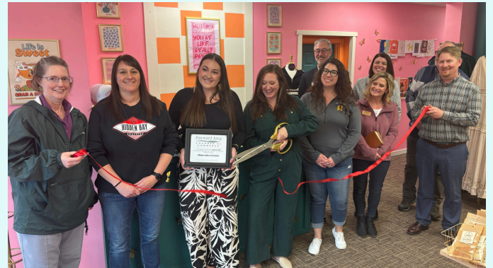
April 26 Ribbon Cutting at Wilde Gifts & Goods to celebrate their new location