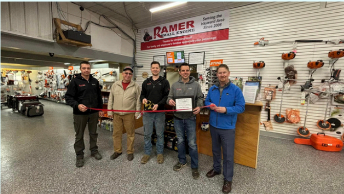
April 26 Ribbon Cutting at Ramer Small Engine to celebrate their recent additions