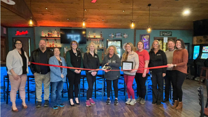
April 2 Ribbon Cutting at Coop's Pizza to celebrate the beautiful remodel!