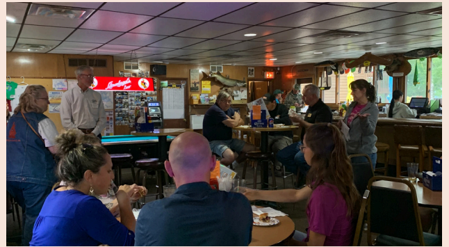
Business After 5 in August @ Deerfoot Lodge & Resort