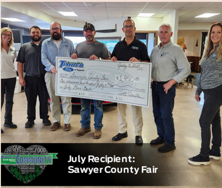
July Recipient: Sawyer County Fair

Timber Ford Gives Back to the Community: $50 donated from every vehicle sold at Timber Ford of Hayward gets added into this growing fund and the public then votes on where funds are donated! In July $1,650 was presented to the American Legion Post 487 and in August $1,950 was presented to the Sawyer County Fair . Follow Timber Ford of Hayward on Facebook to participate!