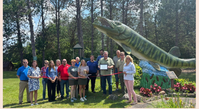
July 10 Ribbon Cutting to celebrate the new playground, gardens, and game room at the Freshwater Fishing Hall of Fame