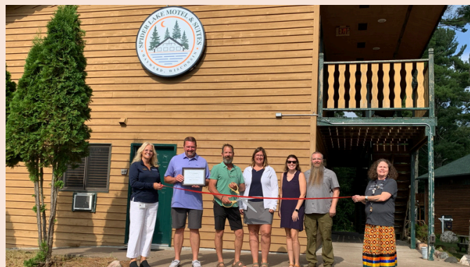
August 26 Ribbon Cutting to celebrate new member Spider Lake Motel