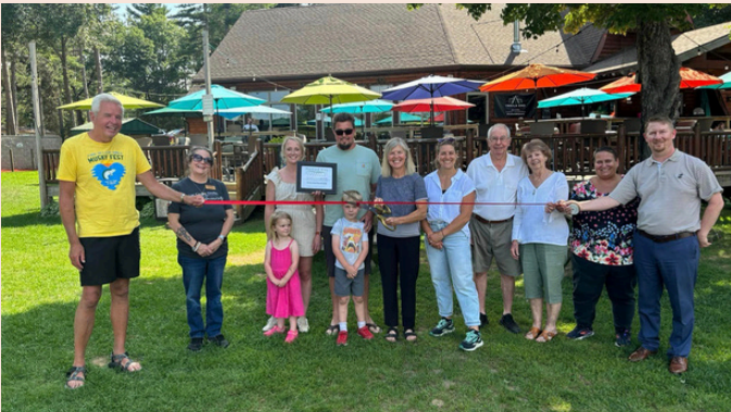
July 19 Ribbon Cutting at Trails End Resort to celebrate their 55th Anniversary