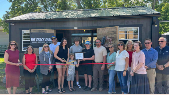
July 3 Ribbon Cutting to celebrate new member The Lot