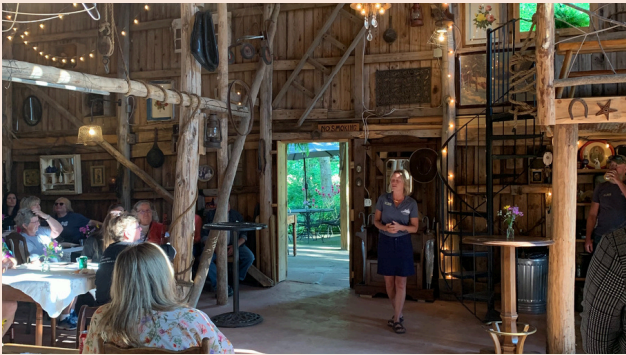
Business After 5 in July @ SylvanDale Wedding & Event Barn with co-host Property Management of Hayward

All members are invited to BA5 events & we hope to see you all at the next event!