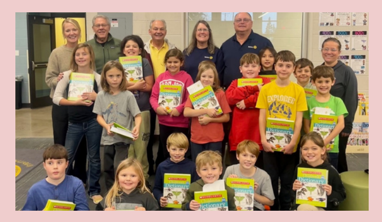
The <u>Hayward Area Rotary Club</u> donated dictionaries to every 3rd grader at the Hayward Intermediate School in December!