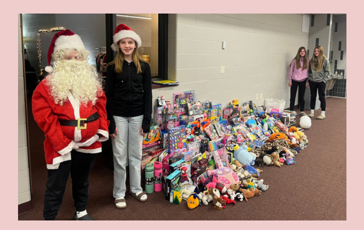
**Pictures and information were provided on business or organization Facebook pages

Donations to the <u>Hayward Community Food</u> <u>Shelf</u> in November & December included: <u>Silver Star Market</u> donated 100 pre-packed holiday food boxes, as well as an additional 64 pounds of shelf stable items in early November; 250 pounds of food was gathered and donated by the <u>High School</u> <u>FBLA</u> during their Trick or Treating event; Johnson Bank donated $1000 on Giving Tuesday to help fight food insecurity; there was a $1200 donation from <u>Sevenwinds</u> <u>Casino, Lodge & Conference Center</u>, which was donated from their Christmas Magic Campaign; <u>Arclin</u> donated 90 pounds of ham in time for Christmas distribution.