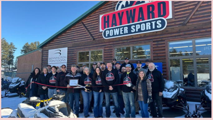
December 13 Ribbon Cutting to celebrate the 25th Anniversary at <u>Hayward Power Sports</u>

November 15 Ribbon Cutting to celebrate the Grand Re-Opening after a full remodel at <u>Hayward WalMart</u>