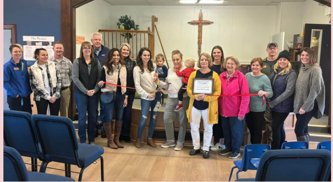
November 8 Ribbon Cutting to celebrate new member and school <u>Trinitas Classical Academy</u>